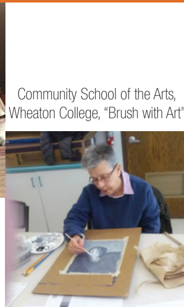
Community School of the Arts, Wheaton College, “Brush with Art”