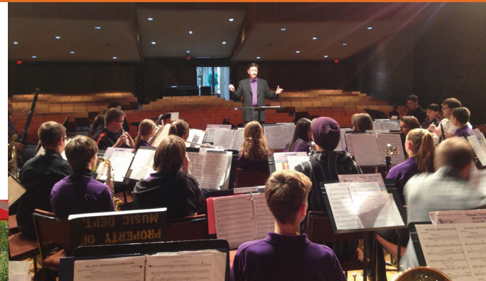
Hubble Middle School band students at NIU