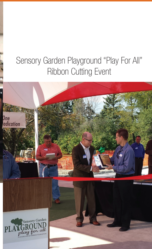
Sensory Garden Playground “Play For All” Ribbon Cutting Event