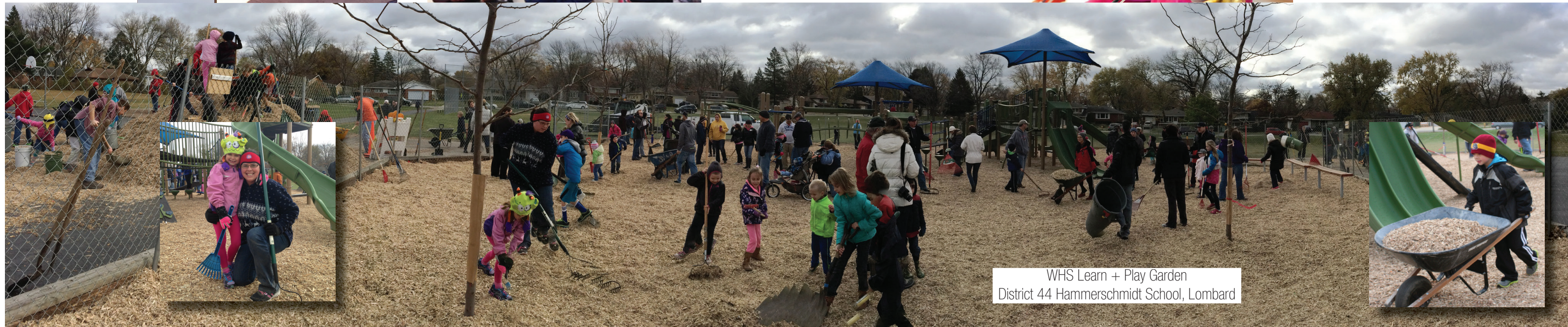
WHS Learn + Play Garden District 44 Hammerschmidt School, Lombard