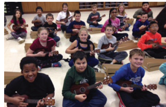
District 89 Ukelele Class