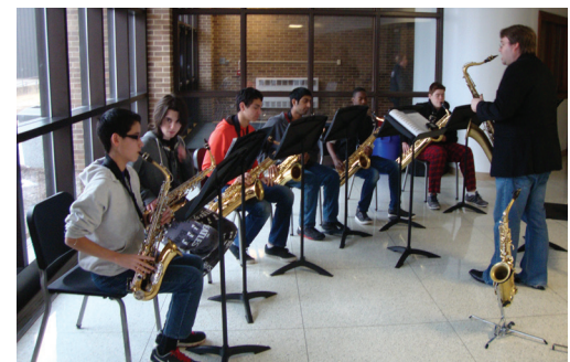
Glenbard South High School, Glen Ellyn Saxophone Clinic