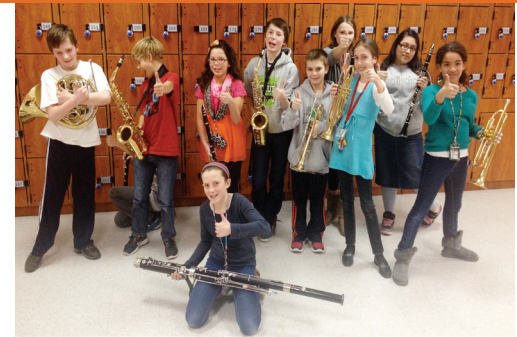
Hadley Junior High School, Glen Ellyn