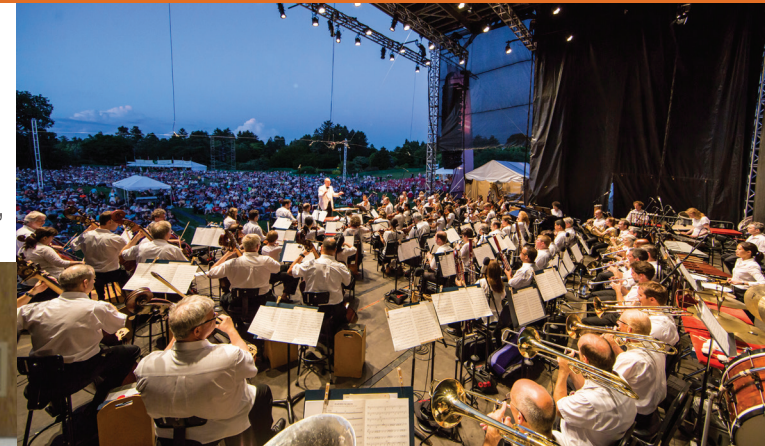
Chicago Symphony Orchestra Concert Series, The Morton Arboretum