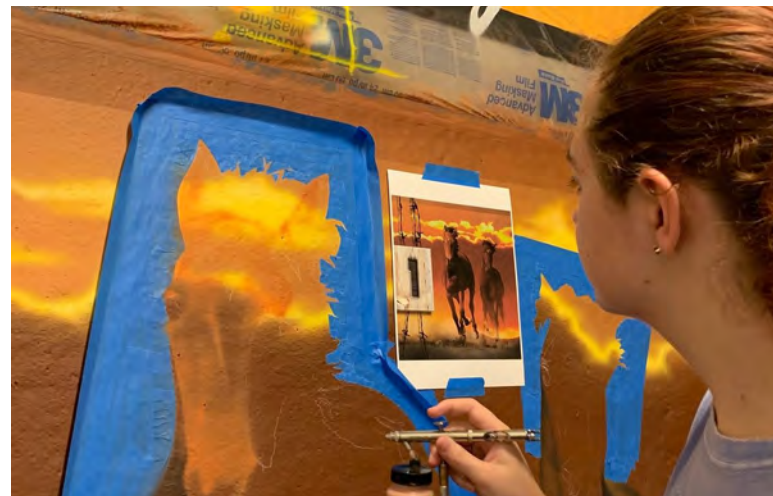
Century Walk: A Metea Valley student paints a mural on the walls of Naperville's Van Buren Parking Facility.

To support orchestral concerts for seniors and students whose facilities and schools are unable to afford the full concert fee.