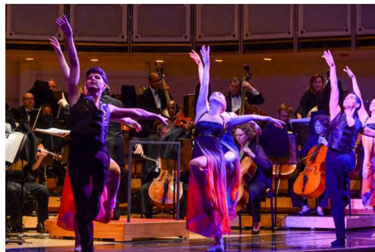
Chicago Sinfonietta: Dancers from the Cerqua Rivera Dance Company perform with the orchestra.