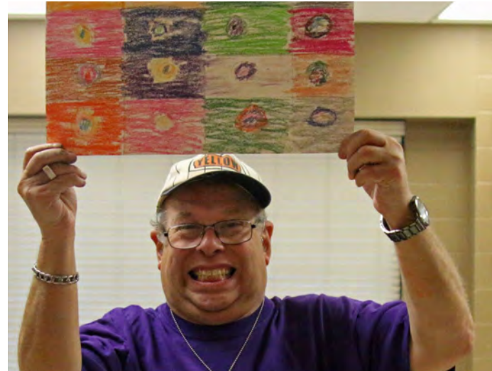
Western DuPage Special Recreation Association: A Creative Corners participant creates art.

"RECEIVING THIS GRANT OPENED SO MANY DOORS FOR OUR MEMBERS. I CAN'T WAIT TO OPEN MORE PATHS TO CREATIVITY." - WAYNE TOWNSHIP