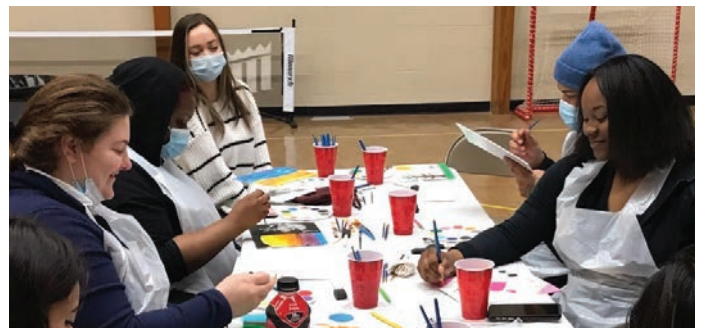
Teen Parent Connection started hosting art therapy and other self-care social groups at its facility in Glen Ellyn.