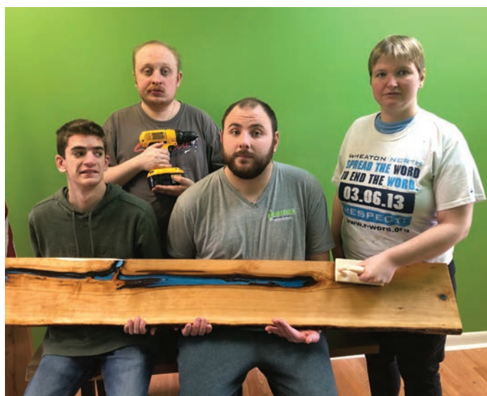
DoodleBug Workshop participants created a console table with a river of blue resin in the center.

To support a LiteZilla installation for community members to express art individually and collaboratively. ■