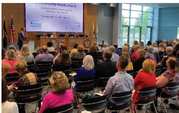
Approximately 100 community members gathered for this timely discussion on mental health and substance use disorder.