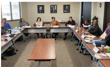
A recent Bright & Early DuPage Parent Advocate Workshop.

B&ED is engaging and uniting local organizations and individuals to build awareness for, and facilitate access to, early childhood education and support services