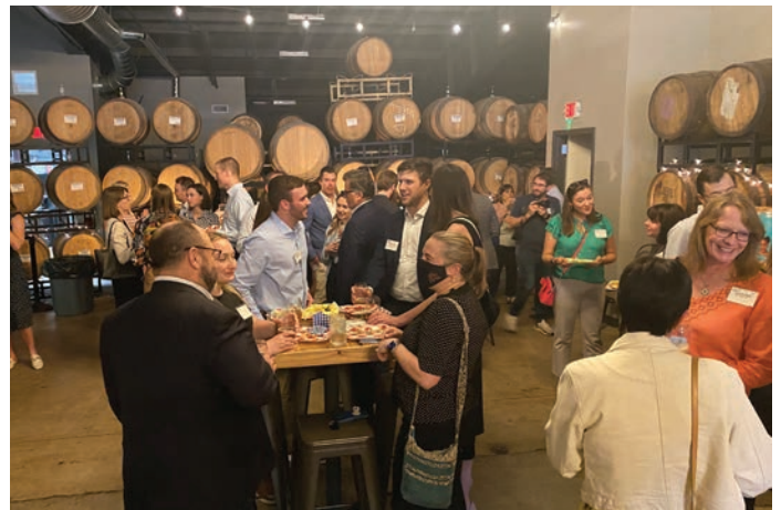
73 NGI members and friends gathered for the Initiative's Summer Social to learn about and support The Outreach House.

Special thanks to the evening's Event Partners, Kuhn, Heap & Monson and Mutual of America ; Catering Partner, Busy Butternut ; and 2023 Silver Annual Corporate Partner, Duly Health and Care . ■