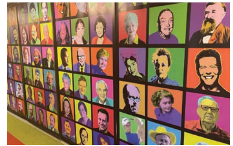
Andy Warhol Portfolios: A Life in Pop | Works from the Bank of America Collection at the College of DuPage's Cleve Carney Museum of Art and the McAninch Arts Center.

In celebration of the exhibit, more than 25 communities rose to the MAC's Pop Art Challenge. Each participating municipality submitted headshots of four local notables, who were "Warholized," arranged in a mural, and installed in a prominent location in that town. This opportunity, sponsored by JCS Arts, Health, and Education Fund of DuPage Foundation , recognizes more than 100 hometown heroes and brings their stories to light. ■