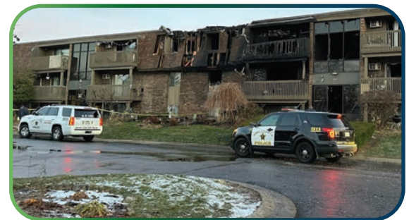
The Main Park Apartments complex in West Chicago suffered a fire in November.

Grants to the three not-for-profits were made possible by generous grant recommendations from the following DuPage Foundation donor-advised funds: