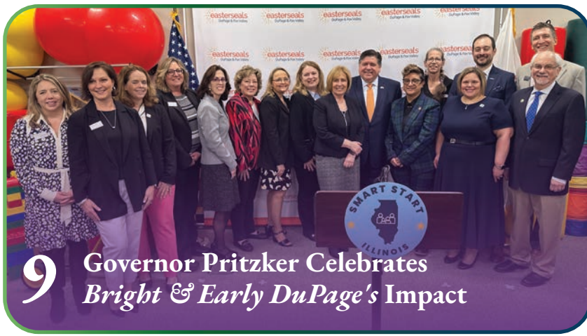
9 Governor Pritzker Celebrates Bright & Early DuPage's Impact