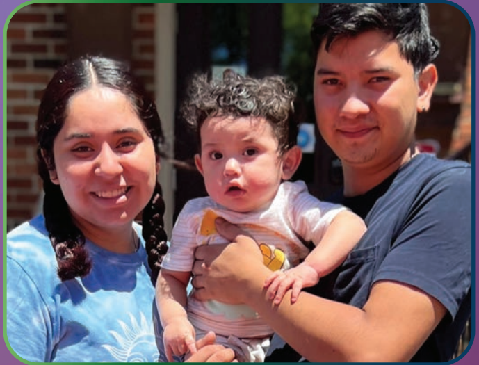
DCTP 2022 Transformational Grantee Teen Parent Connection received $257,500 to expand mental health and case management support to address the increased intensity of mental health needs of adolescent parents.