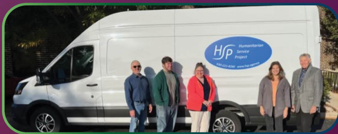
Humanitarian Service Project received a $70,000 DCTP grant to purchase an electric van and charging station.

In response, both Loaves & Fishes and HSP identified the need for cargo vans to keep up with the pandemic-driven increase in demand, and submitted grant applications to the DCTP.