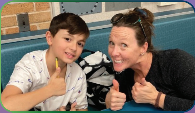
DCTP 2023 Immediate Intervention Grantee Glen Ellyn Children's Resource Center received $50,000 to support mental health and resilience by expanding summer programs and social emotional learning initiatives.

To date, nearly $6.2 million has been committed to DuPage County not-for-profits. A full list of DCTP grantees, along with grant guidelines, application deadlines, and evaluation criteria can be viewed at dupagefoundation.org/DCTP .