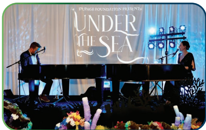
Felix And Fingers Dueling Pianos entertained the guests.

With support from donors, community partners, and sponsors, the event grossed a record-breaking $625,000 for our operations and programs. This funding is critical in helping the Foundation carry out its work of raising the quality of life throughout DuPage County.