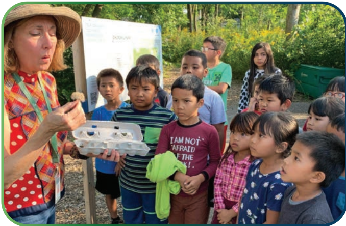
Glen Ellyn Children’s Resource Center received a $25,000 Fall Community Needs Grant to support the academic and social emotional growth of under-resourced K-12 students. Picture taken at The Morton Arboretum.

During the fall 2023 cycle of our Community Needs Grant Program (renamed Community Impact as of 2024), DuPage Foundation granted $605,600 to 46 not-for-profit organizations working in the areas of education, arts & culture, environment, and animal welfare. The following organizations received grants: