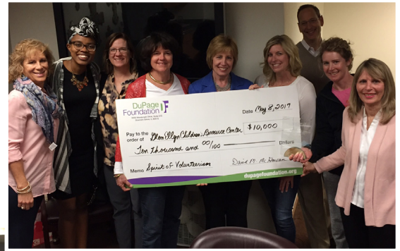
Top - Glen Ellyn Children's Resource Center

Access DuPage , recipient of a $20,000 grant , is a collaborative effort by thousands of individuals and hundreds of organizations in DuPage County to provide access to medical services to the County's low-income, medically uninsured residents. The committee noted