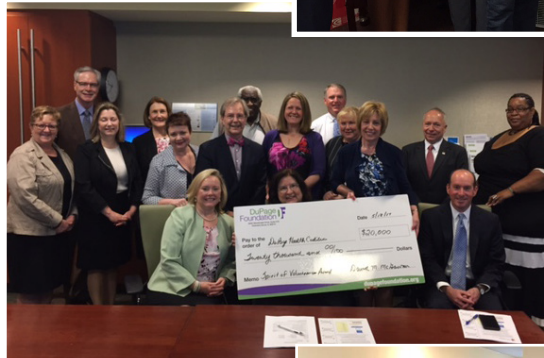
Left - Access DuPage