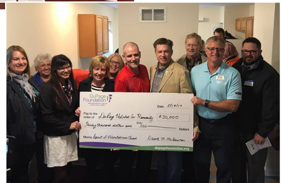
Below - DuPage Habitat for Humanity

the significant number of professionals who are volunteering their time to Access DuPage through primary care, specialty care and clinics. Specific examples cited in its application were mass eye exams to screen diabetic patients, and how services were offered for a patient experiencing language barrier issues.