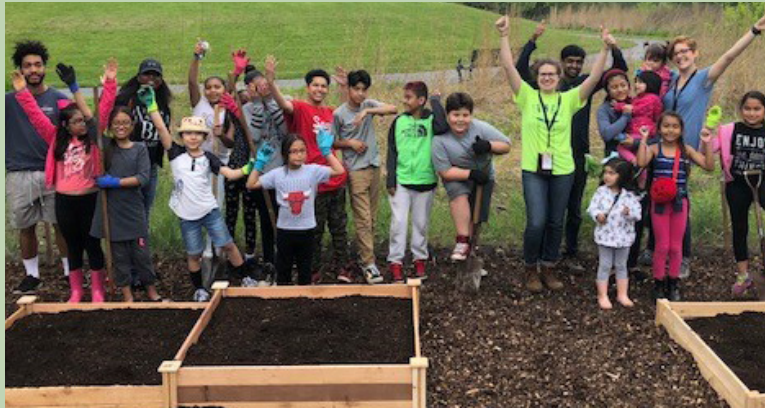
York Community Resource Center students and staff constructed raised beds for vegetable plants during Garden Build Day in May, an activity made possible because of a grant received by Outreach Community Ministries.

The Foundation could not be more pleased to announce that we recently surpassed $35 million in total cumulative grants awarded over our 32-year history!