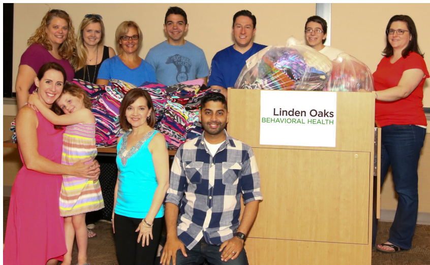
NGI volunteers assisted Linden Oaks Behavioral Health with its stress blanket project in Naperville.

"Thanks for organizing this great group of volunteers and for allowing us to come speak and be a beneficiary of the NGI's