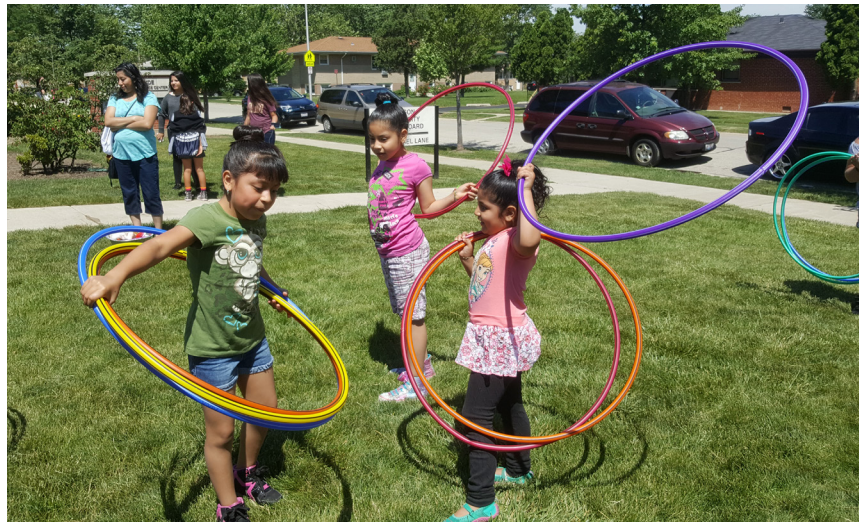
Children celebrate summer fun during the Summer Outreach event held at Addison's Henry Hyde Center.

Download a copy of Bright & Early DuPage's "By the Numbers," a special community report at: goo.gl/swSU1H